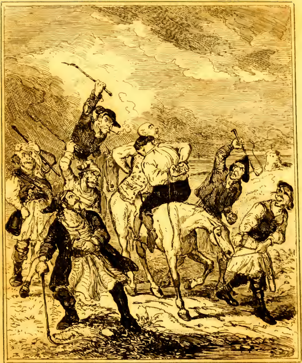
Murder of ... and ...